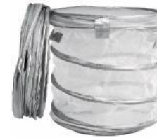
FLEN Laundry basket - RM 35 The nylon cover keeps the contents ventilated and reduces moisture. H55cm Product code: R1004