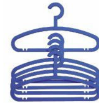
Hemlis Coat Hanger - RM5/5pcs Product code: R1001