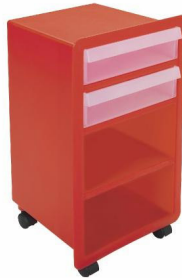
NERO drawer unit RM75. Red plastic. W35*D33, H64cm Product code: R1010