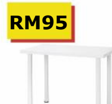
VIKA AMON/CURRY table combination RM95 table top and legs in white lacquered steel. L100*W60, H74cm. Product code: R1025