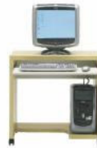
MIKAEL computer table RM189 Pull out keyboard shelf. Castors included. Lower shelf can go on left or right. Shown in birch finish. W76*D50, H76cm Product code: R1014