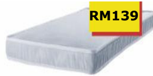
SULTAN JOVIK Single spring mattress RM139 Bonell spring mattress that follow the contours of your body. W92*L189cm Product code: R1019