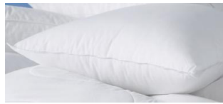
GOSA KRAMA Pillow – RM39 Product code: R1018