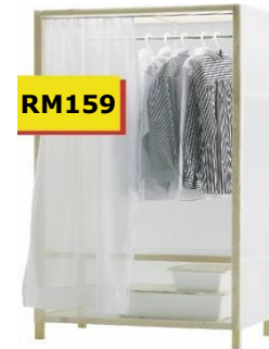
VESTBY Wardrobe – RM159 Untreated solid wood and plastic. Clothes rail and drape included. Polyester/cotton curtain. W90*D50, H180cm Product code: R1024