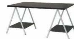
VIKA AMON/EKET table combination RM235 Table top in black-brown. Trestles with shelf in dark grey lacquered steel. L120*W75, H74cm. W45*D50. Seat H44cm Product code: R1026