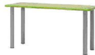
VIKA MANNE/CURRY table combination RM115 Top lacquered olive green. Legs in lacquered steel. L120*W50, H61 Product code: R1027