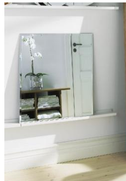
KOLJA mirror - RM55 Glass W60*H60cm Product code: R1012