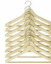
Bumerang Clothes Hanger - RM 19.99/8pcs Product code: R1000

ROOMMART (M) SDN BHD (665549-W) G7, MSC Central Incubator, Multimedia University, Jalan Multimedia, 63100 Cyberjaya, Selangor. Tel: 03-83189528 / Fax: 03-83184764 URL: www.roommart.com.my