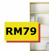
FLARKE bookcase – RM79 Adjustable shelves Birch effect foil finish. W59*D25, H171cm Product code: R1023