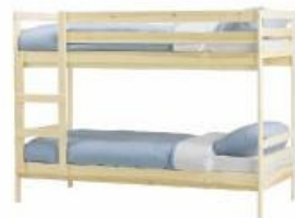
TORDAL single bed frame RM359 Untreated solid wood. Treat with stain, wax, lacquer or oil for a personal touch. W99*L196, H155CM Product code: R1021