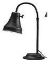
KNIVSTA table lamp RM69 Adjustable arm and shade. Black lacquered steel. Max 60W, H48cm Product code: R1011