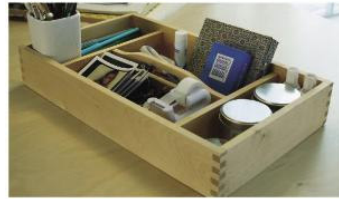
Accessories tray – RM29 Product code: R1008