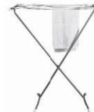
MANGEL Drying rack - RM35 Foldable when not in use. Lacquered steel and plastic. L81*W54, H90 Product code: R1006