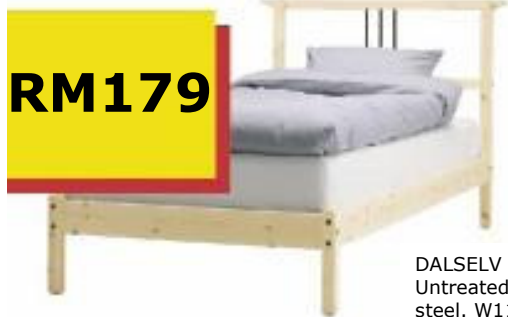
DALSELV single bed frame RM179 Untreated solid wood and lacquered steel. W112*L198.5, H197.5cm Product code: R1022